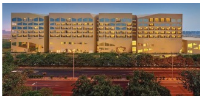
Vivanta New Delhi, Dwarka

Vivanta New Delhi, Dwarka, is a five-star deluxe hotel in Delhi NCR that offers an elegant and spacious venue for IABSE Congress. It is directly connected to the heart of the city with an easy access to the Sector 21 Metro station. Hotels at various rates are available within the range of 3 kilometres.