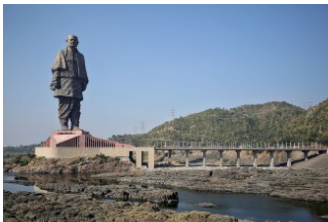
The Statue of Unity - World's Tallest Statue (182 Mtr)