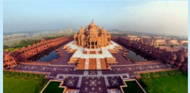
Akshardham Temple, New Delhi