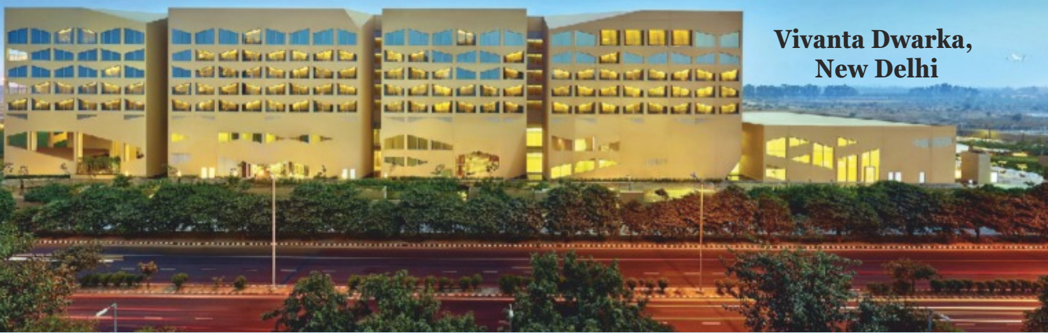
Vivanta Dwarka, New Delhi