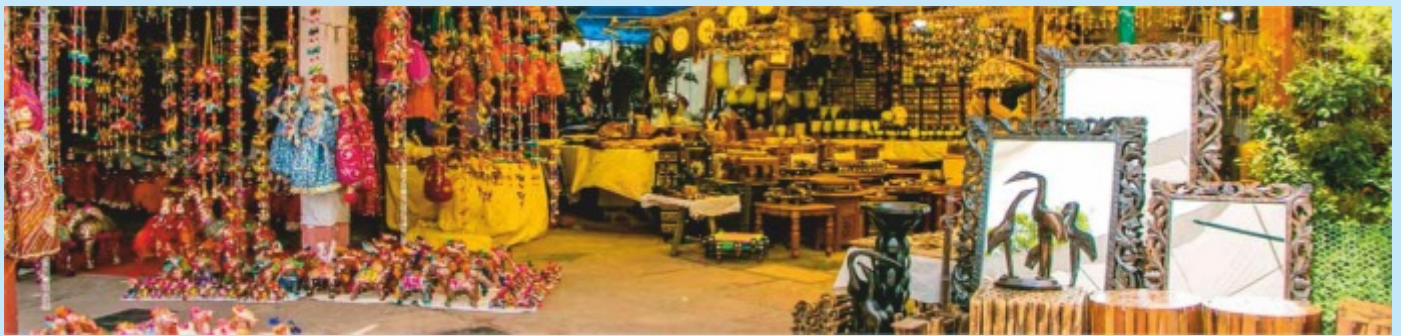
Dilli Haat, New Delhi