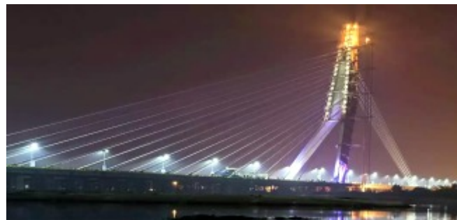
Signature Bridge, Delhi on Yamuna river