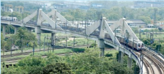
Delhi Metro has ushered in a drastic change in the transportation sector in India

Old Delhi has its own charm with heritage structures and monuments, grand places of worship for all religions; traditional as well as street food places. The city has never stopped growing and developing. Some of the most recent developments include a new War Memorial right near the old War Memorial, the iconic India Gate, the under-construction Central Vista Project and a new Parliament Building.