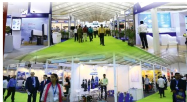
Pre structured Hanger - 12,000 Sq ft Area

IABSE Congress New Delhi 2023 will provide an excellent opportunity to both domestic and international professional organisations / companies to display and promote their products and services in this ever-growing market called India. The exhibition provides a world class platform for buyer-seller meetings and for networking amongst colleagues and experts from both public and private sectors. This platform will provide an insight into the sustainable future requirements, green projects, trends and developments of the profession and will also provide first-hand knowledge to the prospective clients & exhibitors of the availability of the products and services of the players in the field. A separate sponsorship brochure is circulating and is also placed in IABSE website/ ING-IABSE website which provides complete details about sponsorship opportunities at the IABSE congress New Delhi 2023.