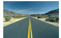
Ministry of Road Transport & Highways Government of India